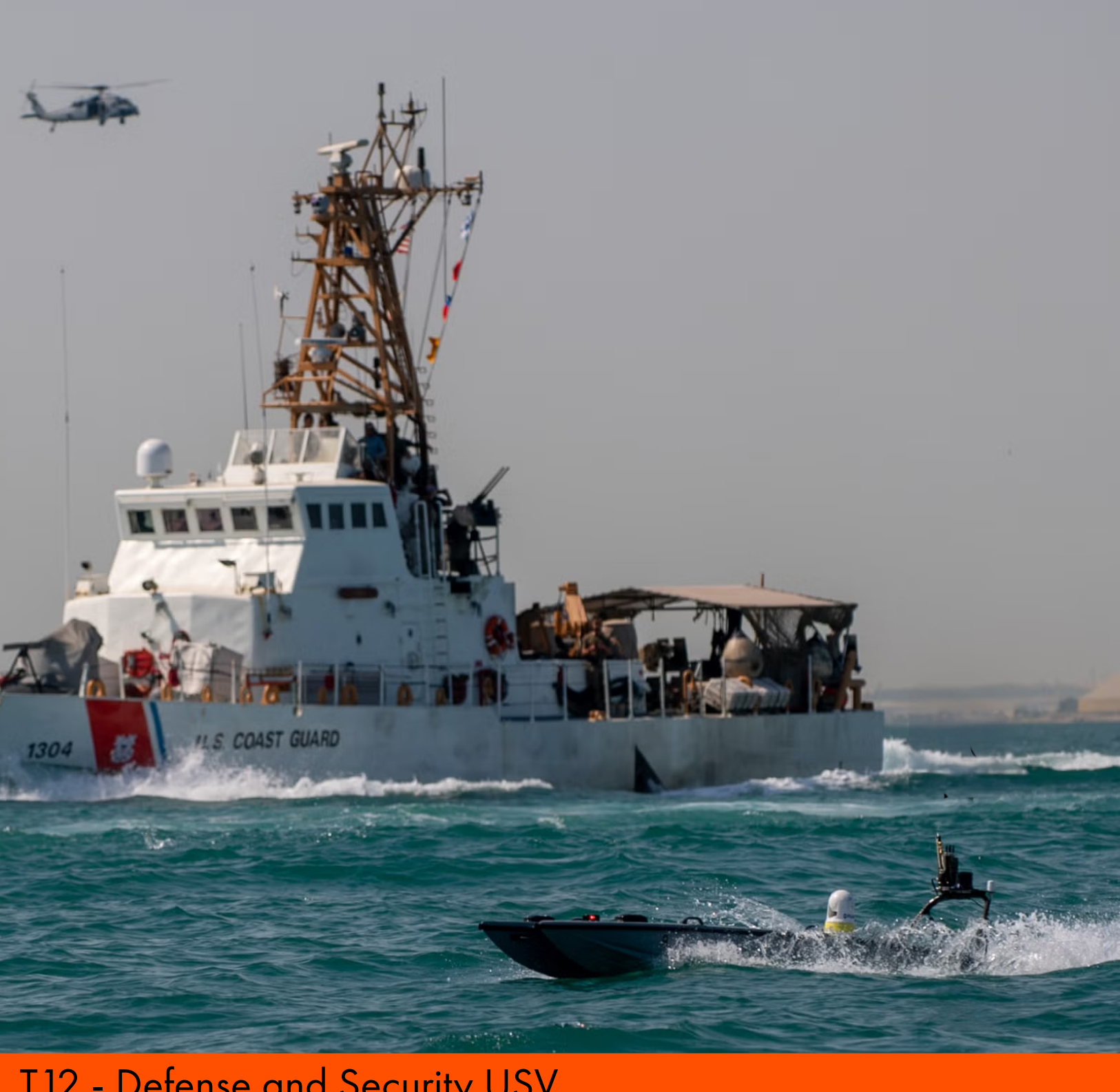
T12 - Defense and Security USV